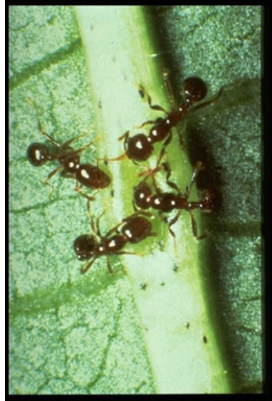
RIFA feeding on plant nectary (Vinson)