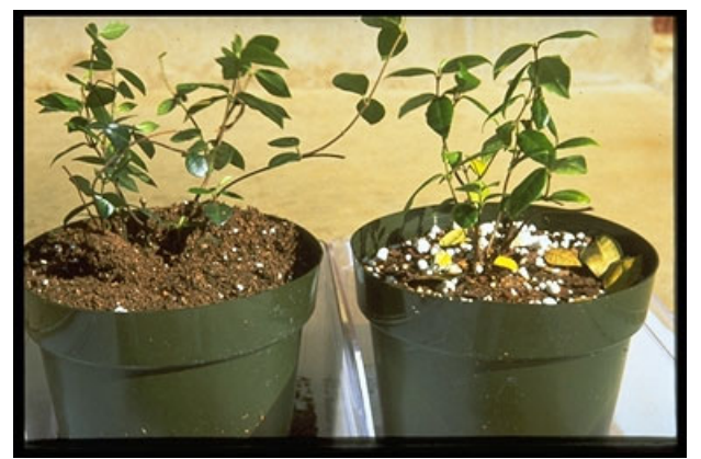
RIFA colony infesting pot plant (Drees)