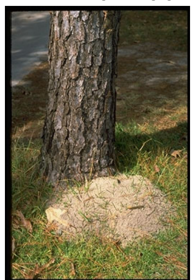
RIFA mound next to tree (Drees)