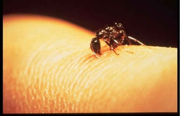
RIFA worker ant biting and stinging