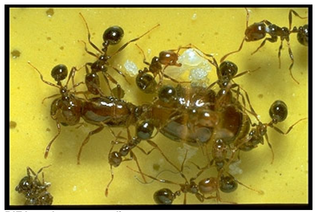
RIFA worker ants tending queen