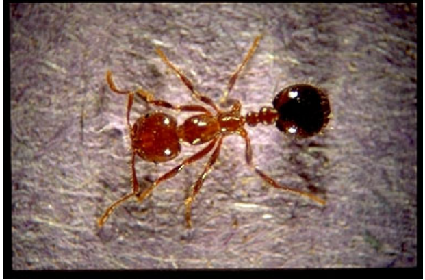
RIFA worker ant (Drees)