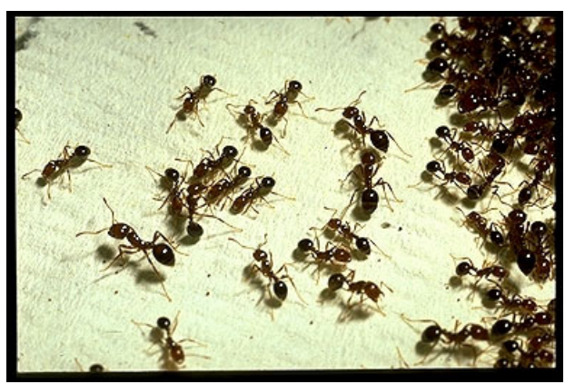
RIFA worker ants (Drees)