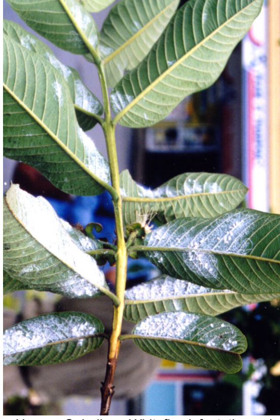
Heavy Spiraling Whitefly infestation of guava plants