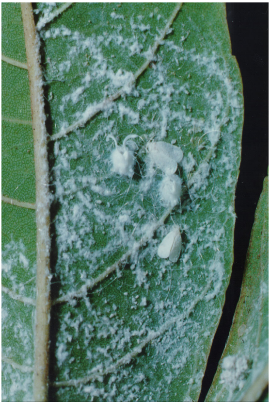
Spiraling Whitefly egg spirals, nymphs and adults on papaw leaves