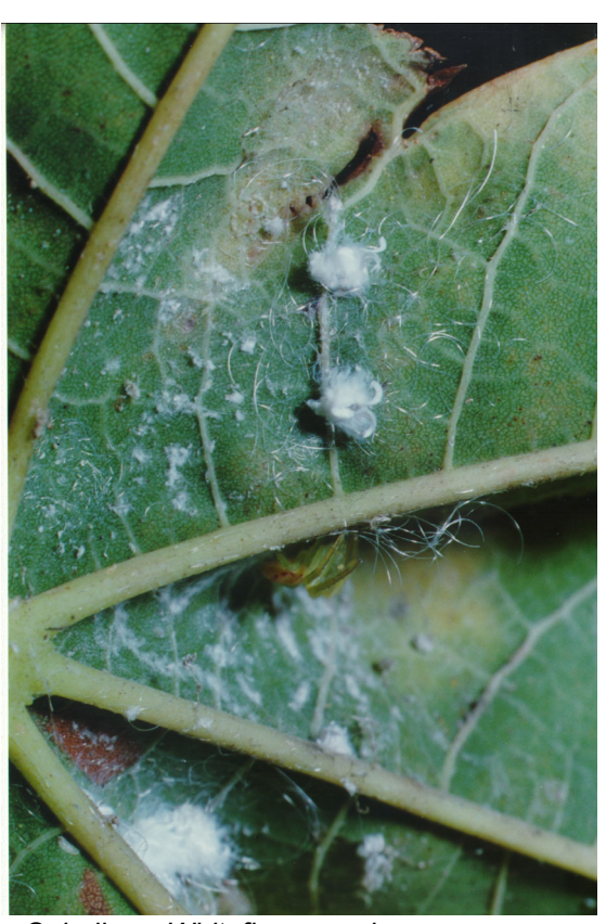
Spiraling Whitefly nymphs on papaw leaves