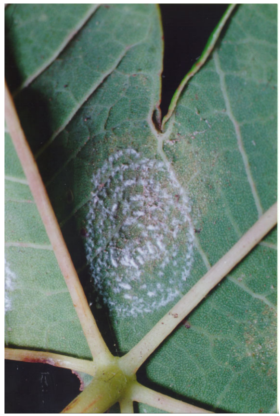
Typical Spiraling Whitefly egg spirals on papaw leaves