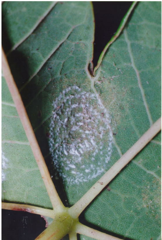
Typical Spiraling Whitefly egg spirals on papaw leaves