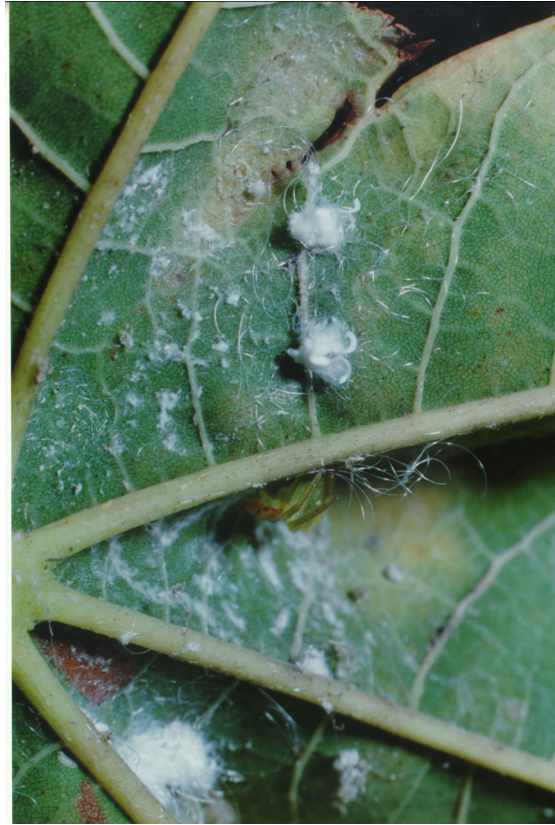
Spiraling Whitefly nymphs on papaw leaves