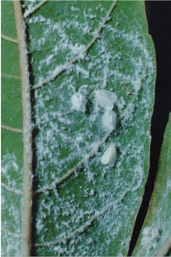
Spiraling Whitefly egg spirals, nymphs and adults on papaw leaves