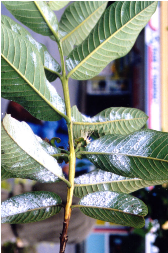
Heavy Spiraling Whitefly infestation of guava plants